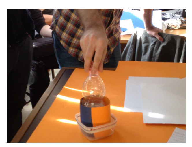
Figure 4: The Warmefresher.

The design process: After trying potential interactions with found objects, the team chose a plastic bottle, and explored vocal associations of direct manipulations on the object, and various liquid sound qualities. Several rehearsals were exploited to evaluate and refine the design idea. Each participant in turn played the roles of the user, the vocal performer, and observer. The final sketch is shown in figure 4, and is composed of a plastic cup, which serves as a warming up/cooling down docking base for the bottle.