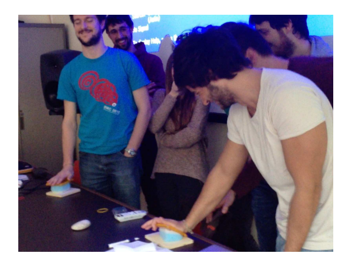
Figure 5: Two Crushingnoises in interaction.

The design process: The brainstorming focused on building relationships between improvised configurations of found objects and continuous manipulative actions. The team explored intuitive associations between sound and gestures. Blindfolded interaction allowed to better concentrate on the sound-action links. Each member either performed the vocal sketch or the physical interaction. In this way, the sound and interaction designers could enable mutual comparison and exchange observations. The final sketch is composed of two small wooden bases between whom a small piece of foam is placed.