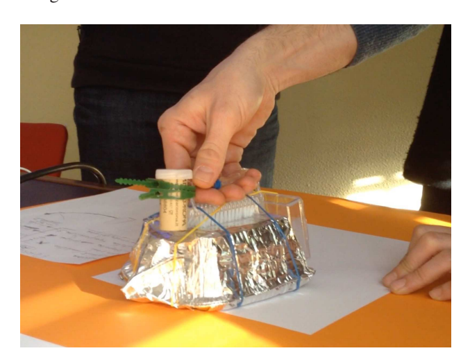
Figure 2: The Maiden Iron.

In the brainstorming several everyday activities where considered for sound augmentation. Ironing was unanimously recognized as an activity where sounds can be profitably used both in continuous manipulations and in signaling. The construction of a mockup iron that could be actually manipulated allowed extensive vocal sketching accompanied by the gestures of ironing. The final mockup is shown in figure 2.