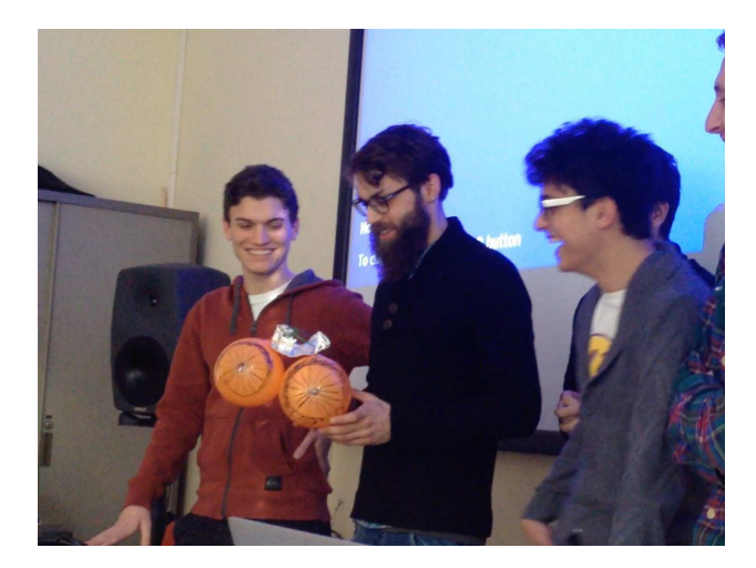
Figure 3: The ElectroSonar ByCycle.

The design process: Vocalizations and gestures were used to produce fast and rough sketches of the envisaged functions. Several and extensive iterations were needed in order to translate the vocalizations in synthetic sounds, on the SDT environment. In practice, the tutor acted like an interface between the software tool and the designers, manipulating control parameters, proposing sounds and waiting for further inputs from the participants. For this purpose, the participants were asked to refine the synthetic sound, by using their voice and gestures.