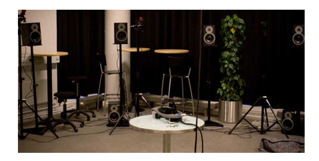
Figure 2 . The Multisensory Experience lab at Aalborg University in Copenhagen

The experiment has been carried out in the Multisensory Experience Lab of the Sound and Music Computing group of Aalborg University in Copenhagen, see fig. 2.